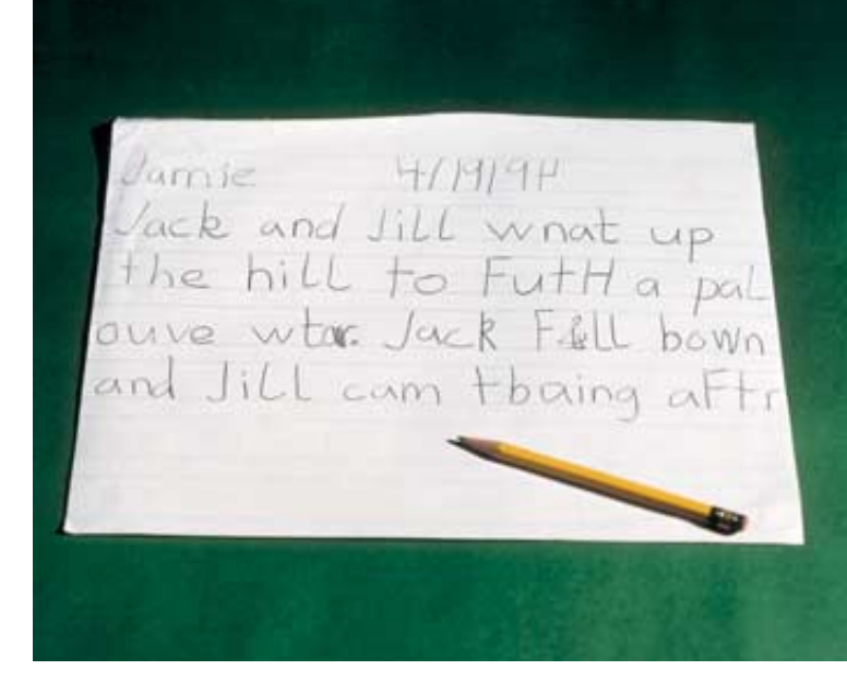
SPELLING ERRORS abound when early readers take to their pencils. Teachers of phonics routinely correct mistakes. Strict devotees of whole-language instruction tend to be more tolerant of invented spellings, choosing to concentrate on the student's meaning.

If schools of education insisted that would-be reading teachers learned something about the vast research in linguistics and psychology that bears on reading, and if these institutions regularly included a modern, high-quality course on phonics, their